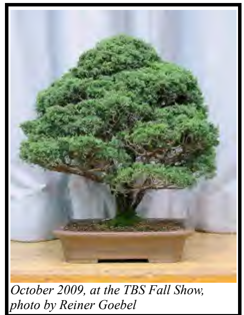
October 2009, at the TBS Fall Show