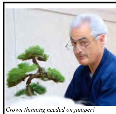
Crown thinning needed on juniper!

right then and there! Those that did deserve some kind of bonsai medal!