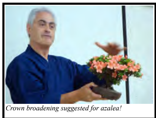
Crown broadening suggested for azalea!