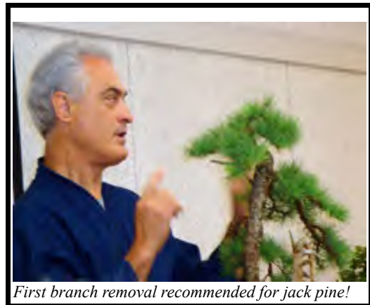
First branch removal recommended for jack pine!

Everything he recommended for our trees was within reason. When he asked about a tree, he always wanted to know why we had grown it that way, and why we had let some superfluous branches grow. And he challenged us to just cut it off right now, to alleviate our anxiety and years of wishy-washy self-doubt. O, that we were brave enough to decide