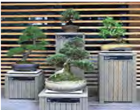
Smaller trees on wooden display stands