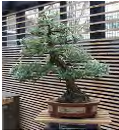
Victorian Banksia Integrifolia