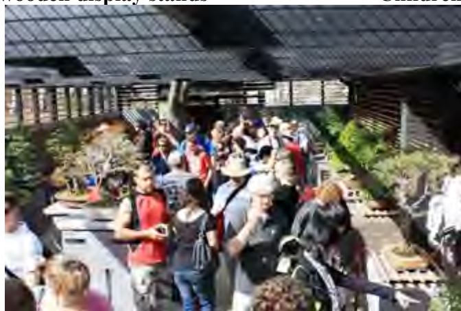
The crowded display at NBPCA – Floriade 2009