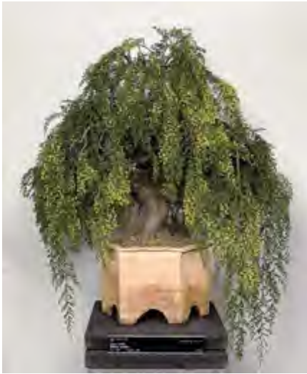
Sticky Wattle 1998

Website http://www.cbs.org.au/NBPCA/Index.htm Arboretum website: http://www.cmd.act.gov.au/arboretum