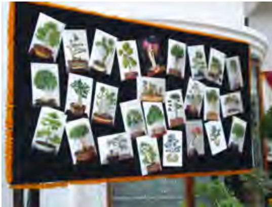
Collection of photographs