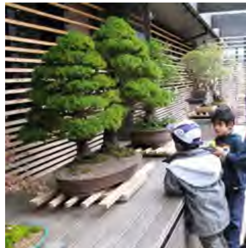
Children at the display