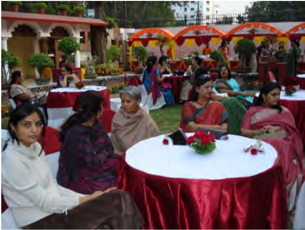
Members relaxing before the event